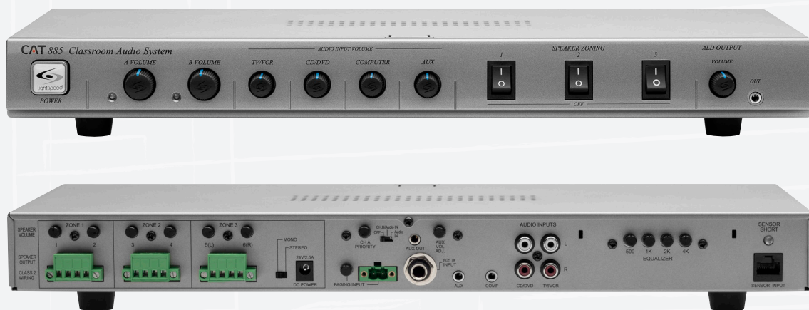
^ REAR VIEW

The Cat 885 delivers 21st century audio quality with advanced features to the classroom and media center. Through clarity and even distribution of sound of all audio in the classroom, it maximizes your investment in technology and strengthens the connection between teachers and students.