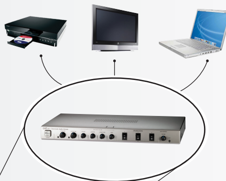
Without classroom audio

Integrate all your classroom technology with ease: